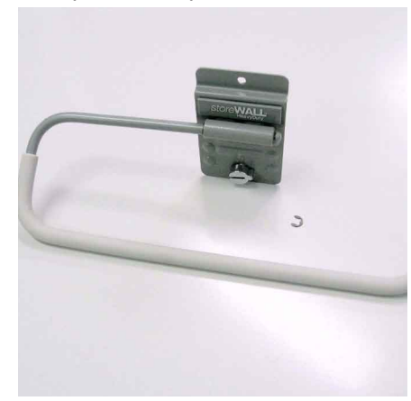
PTH Right hand setting.

The PTH hook is right hand when shipped.