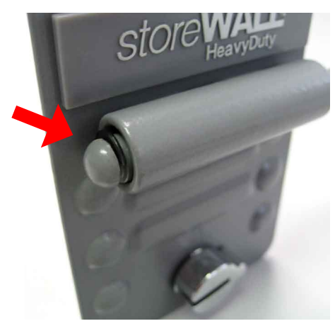
Location of C-ring Pop-off with flat screw driver. To replace, use pliers.