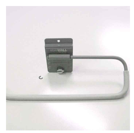
PTH Left hand setting