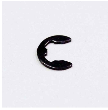
C-ring clip Holds arm in place.